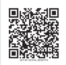
Scan to get started